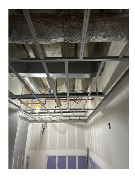
Installing ceiling grids in restrooms on level 2.