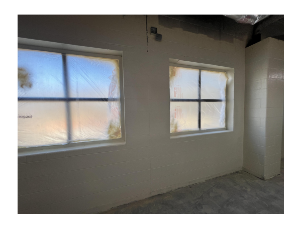
Painting in the corridor on level 2.