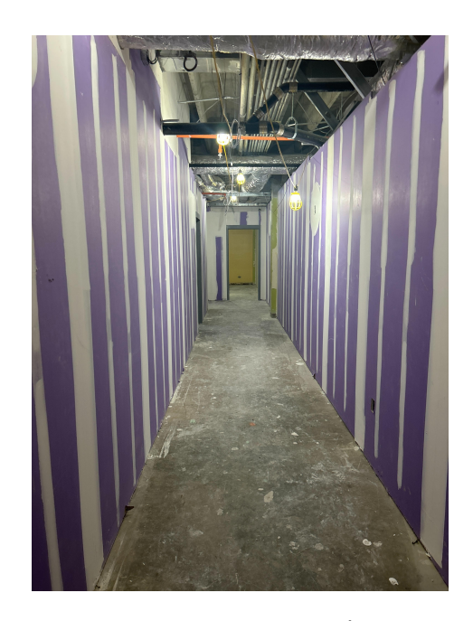
Preparing to paint corridors on level 1.